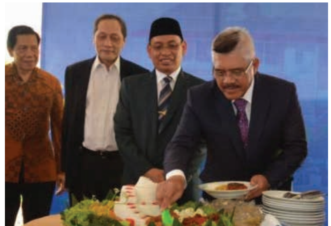
▲ Important figures in Indonesia such as Indonesian Supreme Court Chief Justice Prof. Dr. H. Muhammad Hatta Ali, S.H, M.H (right) attends the Feast to celebrate the UNAIR 64th Anniversary

The other event after that assembly was Feast event for 64th Anniversary of Universitas Airlangga on the first